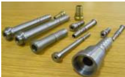
Hydraulic hose ends line