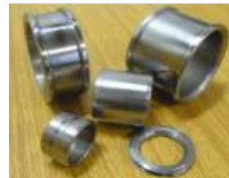
Bearing rings line